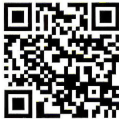
Public Health Lab Container Request Form

NHDES Drinking Water and Groundwater Bureau 29 Hazen Drive; PO Box 95 Concord, NH 03302-0095 (603) 271-2513 dwgbinfo@des.nh.gov